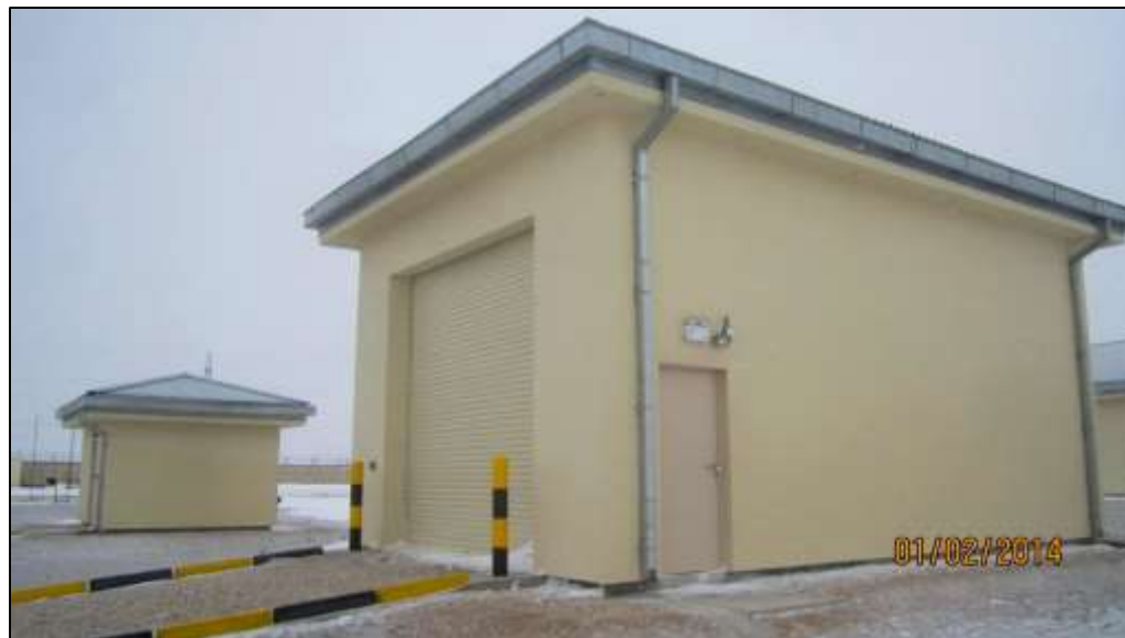
POL Storage Building