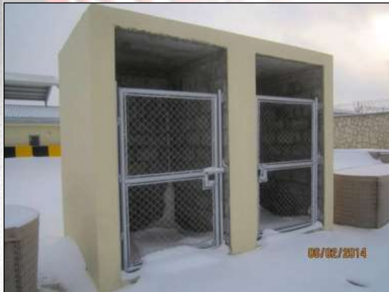
Trash Collection Point